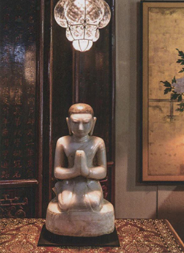
Above: CHARLES JACOBSEN INC. Murano pendant, $2,216; Burmese seated disciple, $17,500. Above right: Granite elephants from Sri Lanka, $5,335 each; carved marble Indian chairs, $6,000 each.